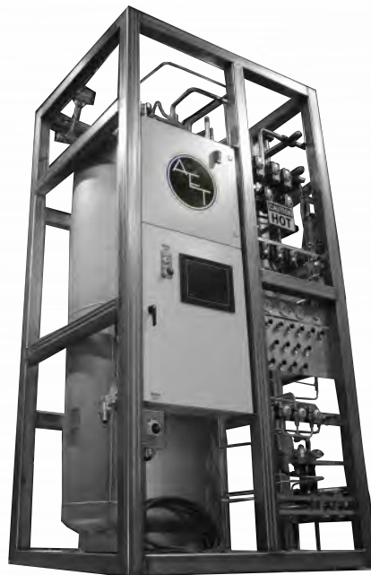
Cryogenic Gas Purifiers Helium, Hydrogen & Others